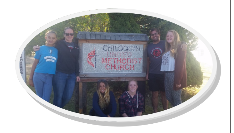
Sierra Service Project at Chiloquin, OR

Saturday, August 6th —Contemporary Praise